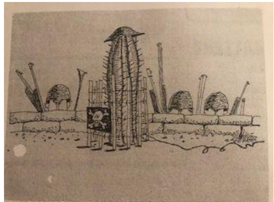
Image appeared in The Phoenix Gazette or The Arizona Republic . Citation for image not known at this time.

Nov 1974 Resolution passed by the board and membership vigorously protesting the advertising, sale, and use of a device known as a "Cactus Smasher"; copies of the resolution are sent to the manufacturer of this device, as well as other interested parties, agencies, and organizations. A copy of the resolution, with signatures, became part of the official minutes of the general meeting.