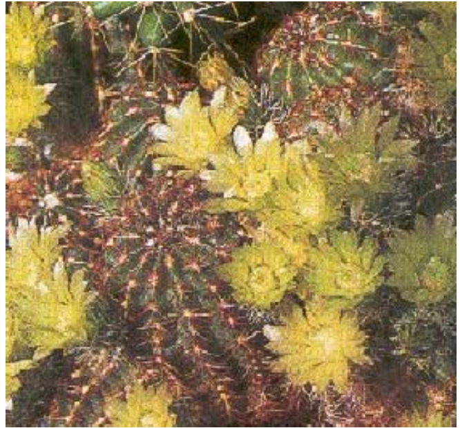
Echinocereus viridiflorus 5

C.A.C.S.S. P O BOX 8774 SCOTTSDALE, AZ 85252-8774 USA