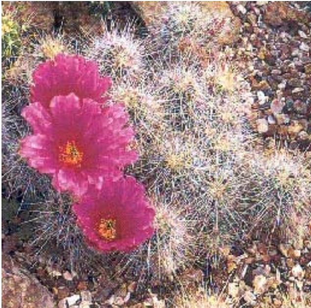
E. stramineus (Porcupine hedgehog) 2

Many form large clumps, but some cluster only sparingly and some are solitary. All flower in the spring to early summer with big, showy, mostly satiny flowers in yellow, green, brown, pink, or purple. E. triglochidiatus has heavy, waxy flowers of orange or red. The pistil at an Echinocereus flower's center is almost always green. Unique to the genus, emerging flower buds tear through the plant's skin above an areole, leaving a scar after fading, rather than arising from areoles or axils between areoles as in other cacti.