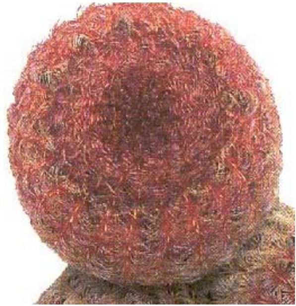
E. rigidissimus v. rubispinus 3

when grown in less than full sun or when planted in soils containing much organic material.