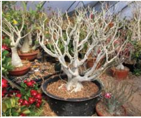
Figure 4b. After pruning, the plant's attractive branching structure is more visible. New growth will be vigorous and will flower better.