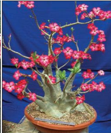
Figure 2. This Adenium arabicum X obesum hybrid is just beginning to leaf out after winter dormancy. It is using very little water and should be watered sparingly until days are hot and it has a full canopy of foliage.