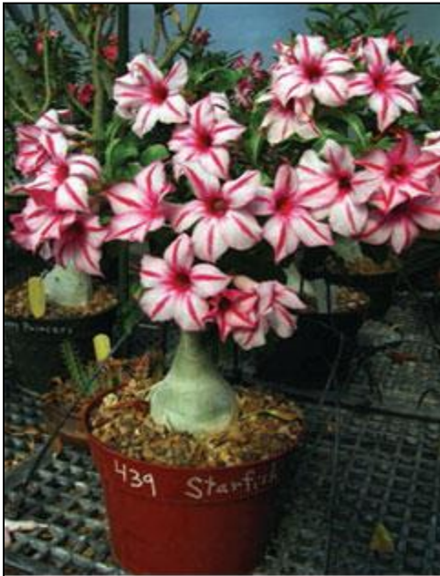
Figure 1. Adenium 'Starfish', one of many striped cultivars to be created since 2003.