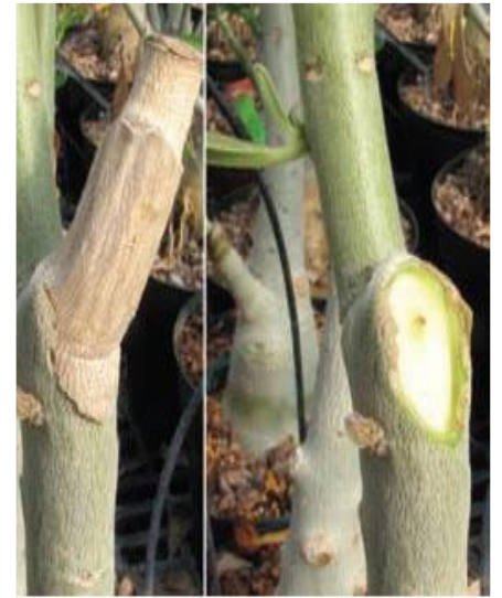
Figure 3. Left: A branch has died and dried, forming an abscission layer. Right: The dried branch can be pulled off; it will break cleanly between the dead and live tissue.