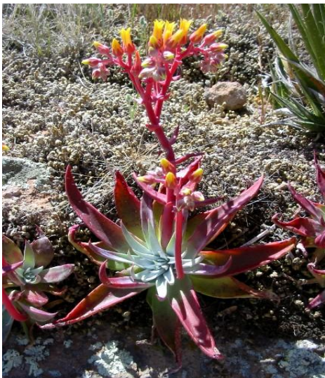
Dudleya saxosa collomiae