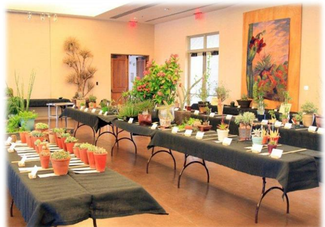
Photos of 2012 Show and Sale