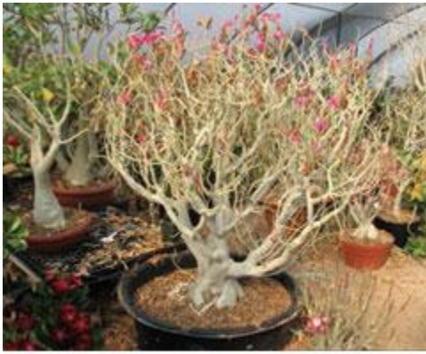
Figure 4a. This old 'Crimson Star' has many crowded, overlapping, and droopy branches. It looks messy.