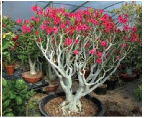
Figure 4c. The same plant flowering the summer after it was pruned.