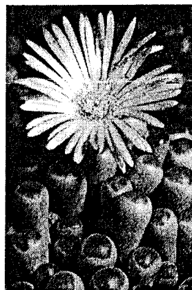
Fenestraria aurantiaca 1

As we who grow Mesembs know, their conditions vary considerably, and it may take some time to learn how best to grow them in our greenhouses or on our patios. (Cont. on page 2)