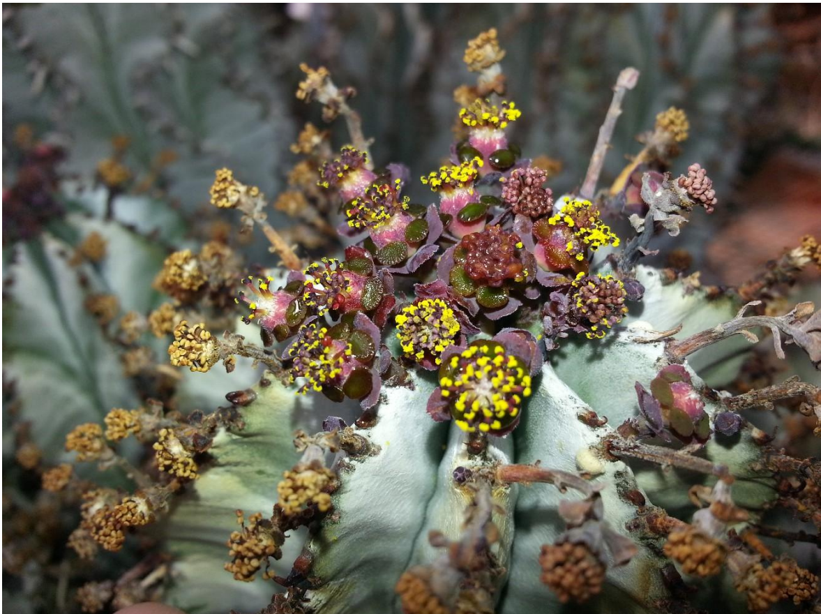
Euphorbia polygona cv 'Snowflake'