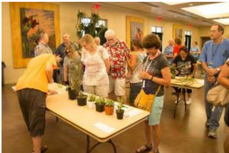
Members and guests study plants to decide which plants to bid on.