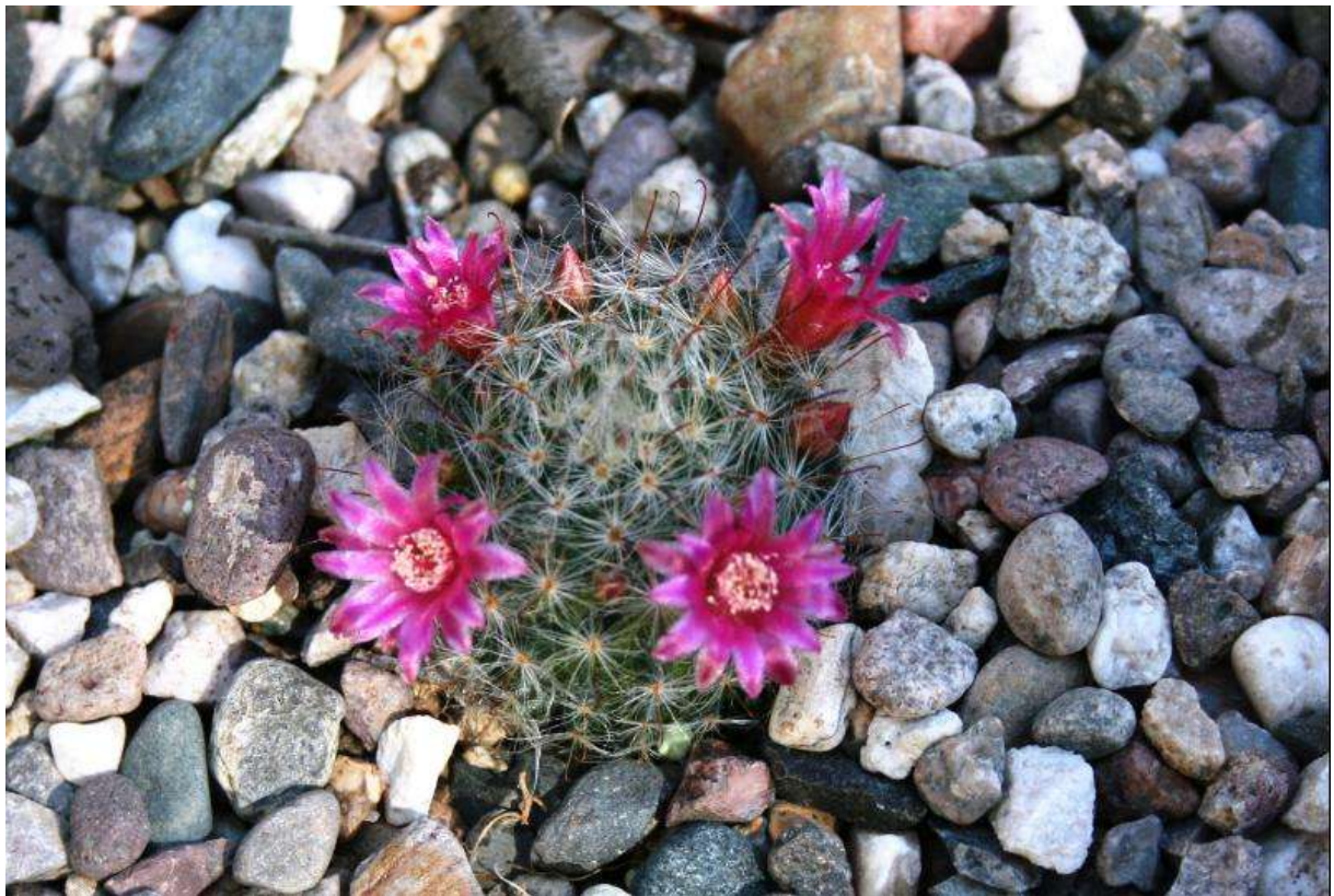
Mammillaria bocasana ssp bocasana roseiflora