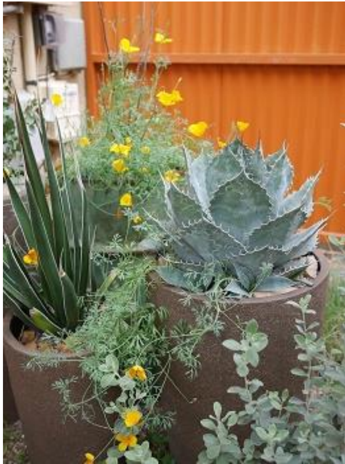
Agave pelona, left, and Agave parryi, right.