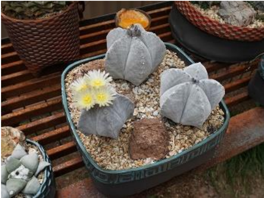
Astrophytum myriostigma