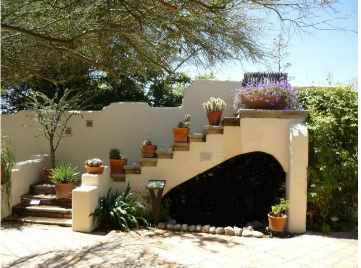
Garden feature in Tohono Chul Park, Tucson Patrick