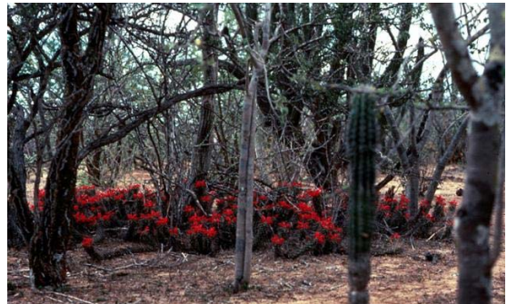
Figure 4 - Cochemiea poselgeri