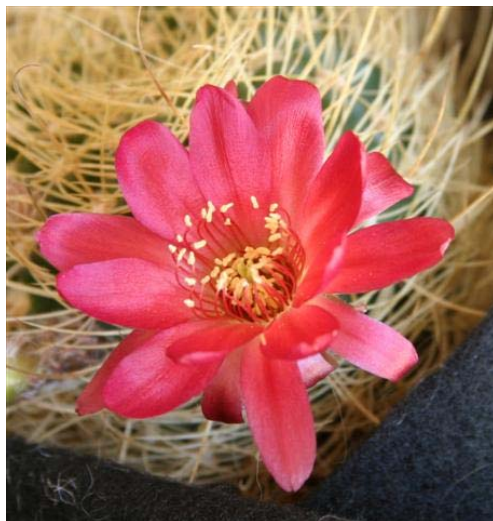
Lobivia sp Bolivian Cactus