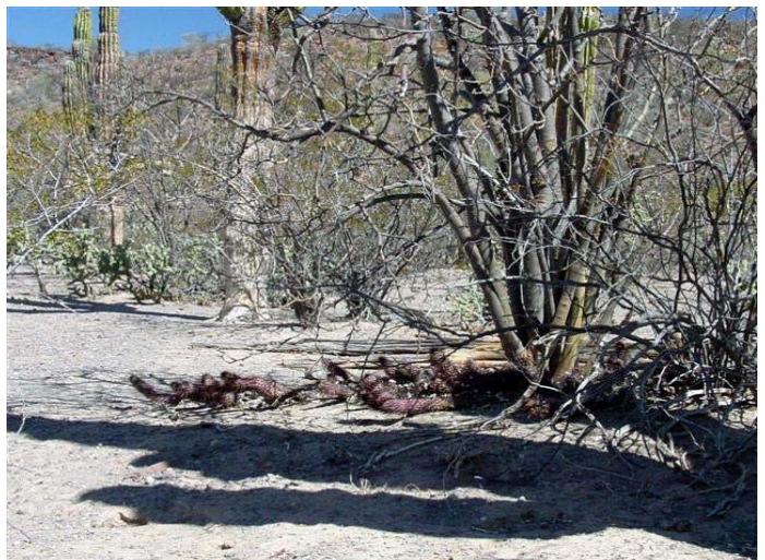
Figure 3 - Cochemiea poselgeri

Cochemiea is a small genus of only five species, all endemic to Baja California. The plants vary from tight clusters of stout stems like a hedgehog cactus (e.g., C. setispina , Figure 2), to long, thin, creeping stems (e.g., C. poselgeri , Figure 3). All five species have clusters of tubular red flowers that are borne at the stem tips following summer rains.