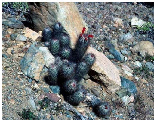
Figure 6 - Cochemiea pondii is endemic to Cedros Island off the Pacific coast of Baja California.