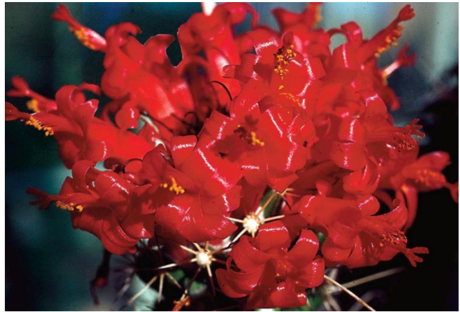
Figure 1 - Cochemiea

What would you get if a Mammillaria adapted to hummingbird pollination? You would get a Cochemiea . A typical pincushion flower is a small pink funnel. Imagine elongating that funnel, making it narrowly tubular, and changing the color to bright red. Now you have a Cochemiea (Figure 1).