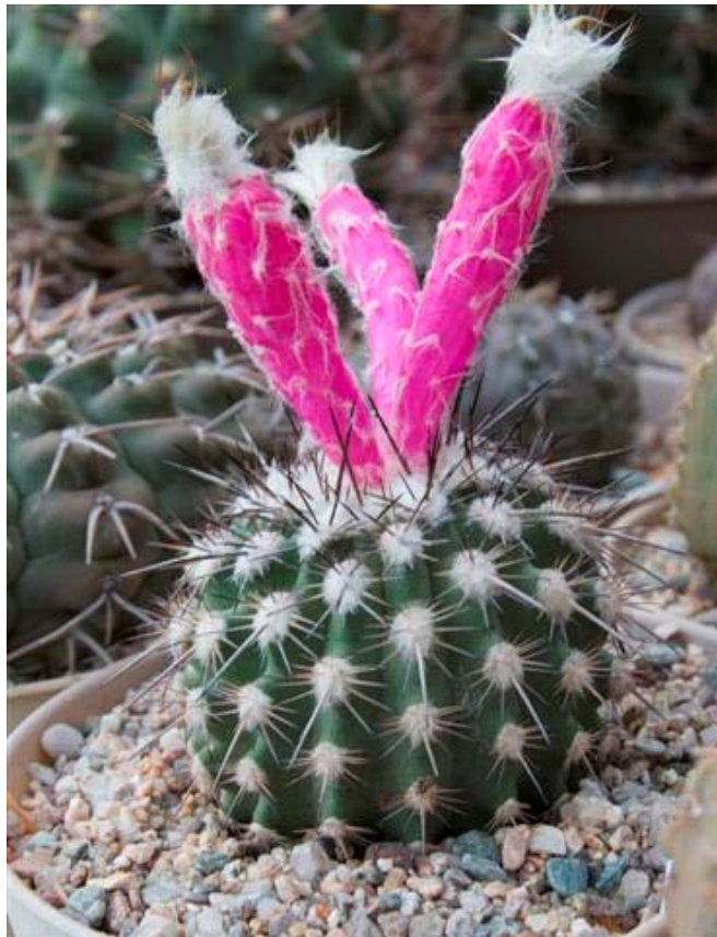
Islaya islayensis in fruit by Cliff Fielding