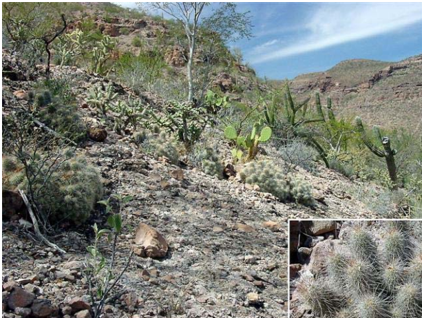
Figure 2 - Cochemiea setispina

Cochemiea is a small genus of only five species, all endemic to Baja California. The plants vary from tight clusters of stout stems like a hedgehog cactus (e.g., C. setispina , Figure 2), to long, thin, creeping stems (e.g., C. poselgeri , Figure 3). All five species have clusters of tubular red flowers that are borne at the stem tips following summer rains.