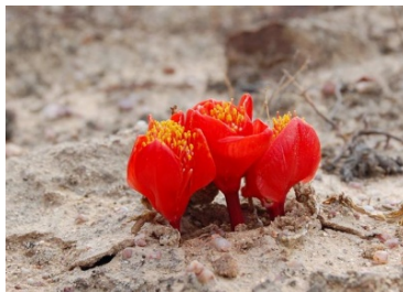
Haemanthus crispus by Cliff Fielding

Leo is offering a seminar showing you how to sprout these plants from seed or bulbs and grow them to bloom. The seminar is limited to 20 people and will be held at a location to be determined on Saturday, October 2, at 2 pm, the best time to plant the seeds. There will be a $20 materials fee which pays for containers, growing medium, seed and bulbs, and printing a syllabus. If the cost is less than $20, the extra will be refunded to you. Each participant will take home at least 10 containers, a different species in each. We will have seed from Silverhill Seed in Cape Town, South Africa. The website is www.silverhillseeds.co.za (yes, this is spelled correctly). We will also have Oxalis bulbs from Telos Rare Bulbs in Oregon, www.telosrarebulbs.com . If you want to order some of your own seed or bulbs to plant at the seminar, you are welcome to do so. Be advised that importing seed from other countries requires a US Department of Agriculture permit. Contact Steve Martinez to reserve a spot.