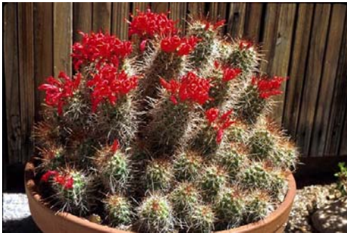
Figure 4 - Cochemiea setispina

Unfortunately, this beautiful genus is difficult to find in nurseries.