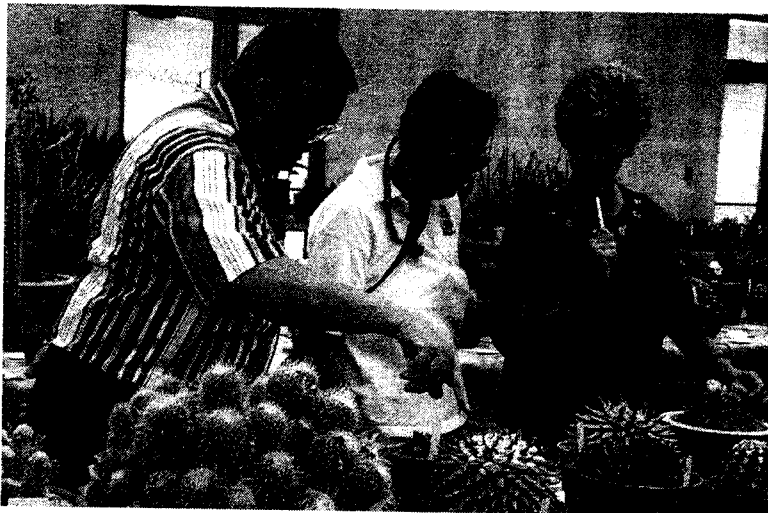
The judges examine all the entries in division 26 - Ariocarpus.